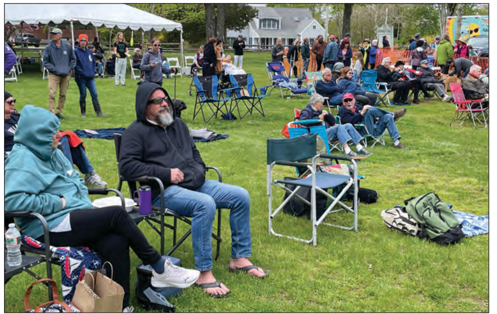
Spectators braved the chillier temperatures last weekend at Brooks Park for live music, beer and food during the Rockin' Picnic in the Park.