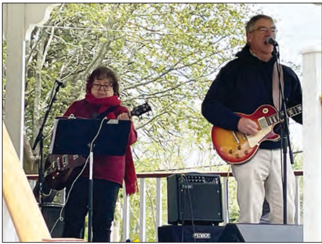
Sensible Shoes entertained the crowd at Harwich's Brooks Park during WOMR's Rockin' Picnic in the Park on May 11.