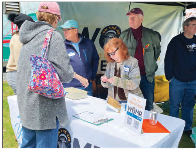
Staff at WOMR greet festival goers May 11 at Brooks Park. The community radio station is based out of Provincetown.