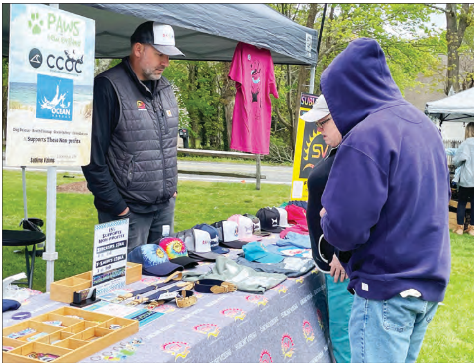
Vendors including Sublime Visions were on hand at last weekend's concert.