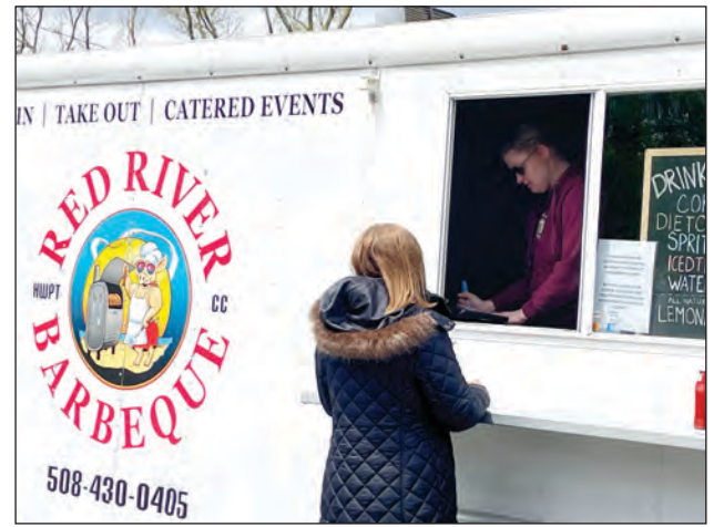
Red River Barbecue were among the vendors dishing out the eats at last weekend's festival.